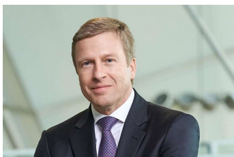
Oliver Zipse (b. 1964) Member since 2015 Chairman (since 2019)