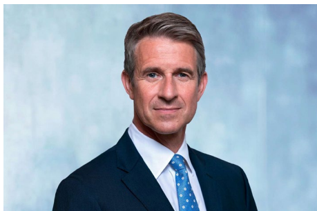
Stefan Quandt Bad Homburg v. d. Höhe