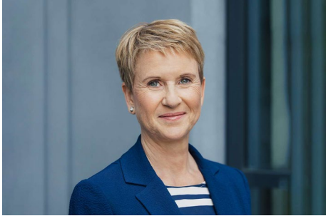
Dr hc Susanne Klatten Munich