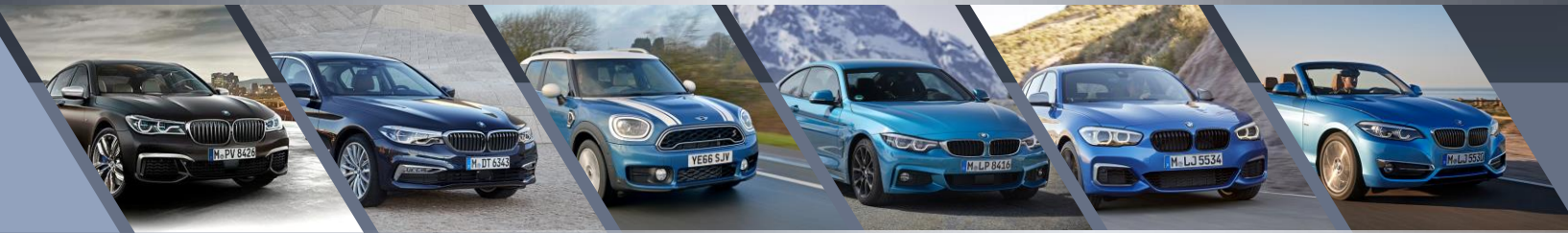
BMW 2 Series