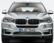
BMW X5 xDrive40e iPerformance