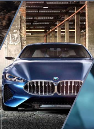
BMW 8 Series