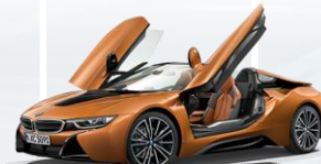
BMW i8 Roadster