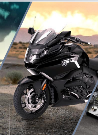
BMW K1600 Grand America