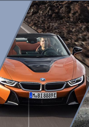
BMW i8 Roadster

... AND WE WILL KEEP THE MOMENTUM ROLLING IN 2018.