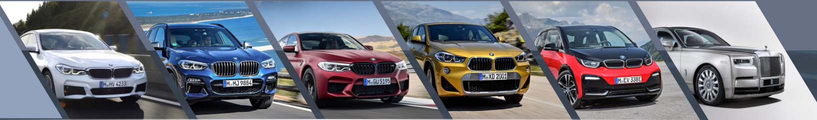
BMW 6 Series Gran Turismo