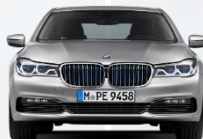
BMW 740e iPerformance